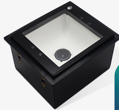
FM3080 Hind stationary scanners