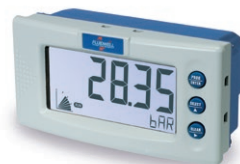
D-Series: DIN Panel mount Indicators