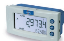
D-Series: DIN Panel mount Indicators