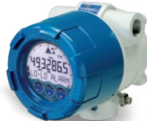
E-Series: Explosion proof Totalizers