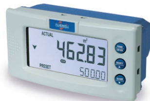
D-Series: DIN Panel mount Indicators