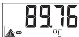
F040 / D040 display