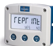
F-Series: Robust field mount Indicators