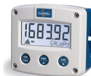
F-Series: Robust field mount Indicators