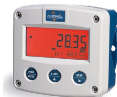
F-Series: Robust field mount Indicators