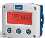
F-Series: Robust field mount Indicators