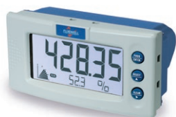
D-Series: DIN Panel mount Indicators