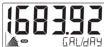
F090 / D090 display