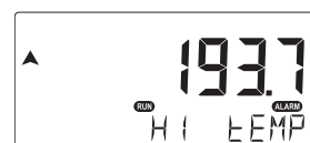
F043 / D043 display