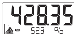
F070 / D070 display