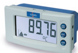
D-Series: DIN Panel mount Indicators