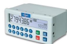
N-Series: Batch Controllers