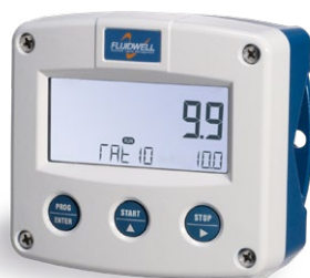
F-Series: Robust field mount Indicators