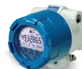
E-Series: Explosion proof Totalizers