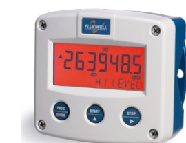
F-Series: Robust field mount Indicators