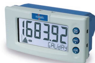
D-Series: DIN Panel mount Indicators