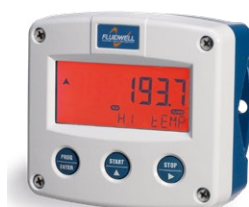
F-Series: Robust field mount Indicators