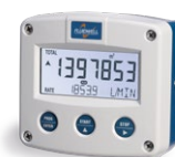
F-Series: Robust field mount Indicators