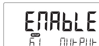
Easy menu structure