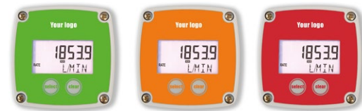
Your brand customization

The basic indicators of the B-Series have all the benefits you may expect from a Fluidwell product: It's durable, reliable and very easy to operate. For more advanced functionality we recommend our D-, E-, F- and N-Series.