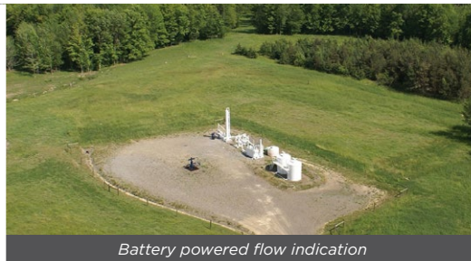
Battery powered flow indication