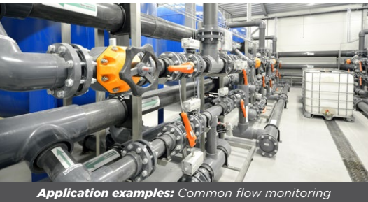
Application examples: Common flow monitoring